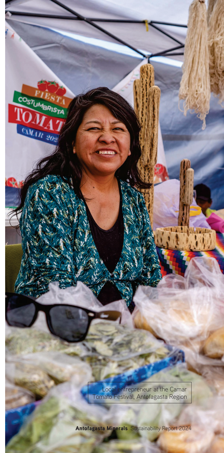
Local entrepreneur at the Camar Tomato Festival, Antofagasta Region