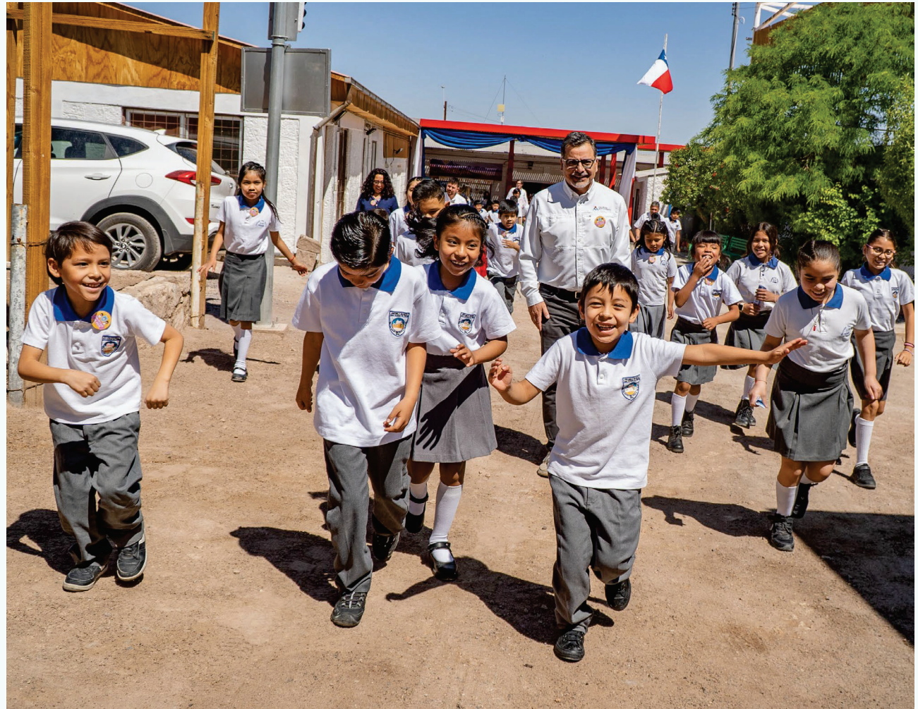
Inauguration of the renovation works at San Roque de Peine School

This initiative was developed collaboratively by the Municipality of San Pedro de Atacama, the parents and students of San Roque School, and Zaldívar. The project aims to create a healthy, inspiring, and safe environment for students, enhancing their learning experience. As part of this effort, a new teacher has been added to the school staff, and classrooms and educational facilities have been renovated and upgraded. Additionally, a children's play area has been constructed.