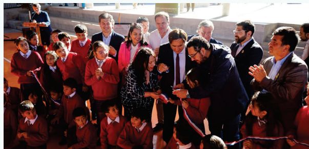
The commune of Canela inaugurated one of the most modern schools in the country

In line with our investment in culture, the heritage rescue book "Culinary Constellations of Choapa" was launched in La Serena and presented in all the communes of the Choapa Province. Created by Sonia Montecino, winner of the 2013 National Prize for Humanities and Social Sciences, this effort, supported by Los Pelambres, aims to preserve Choapa's gastronomic heritage.