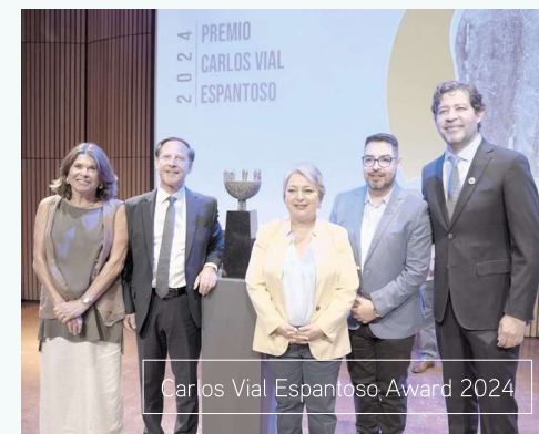
Carlos Vial Espantoso Award 2024