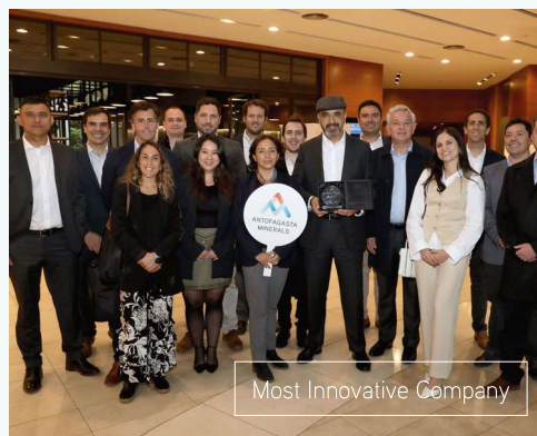
Most Innovative Company